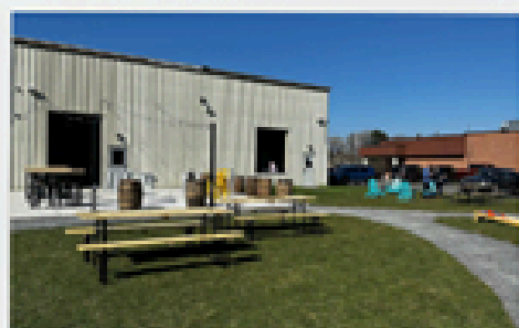
1200 East Water St. - Syracuse