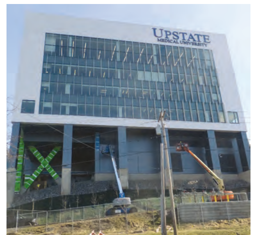
The new academic building nears completion

"Each classroom may be transformed into an active learning environment with five small group computer/tablet workstations to share a flat panel display." Marks added that the 350-seat lecture room, the largest gathering space on campus, will feature video projection and sound for large-venue presentations. Designed for optimal flexibility, the large lecture room will also be able to be divided into two smaller spaces with centered teaching stations and video projectors and screens. Both spaces will have the capability to transmit live presentations to remote locations, and sessions will be recorded for later review. Students also will be able to access a variety of common