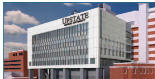
An artist's rendering of the new academic building slated for completion in 2016.

"The DPT and PA programs will each occupy the better part of a floor with each featuring a practice laboratory, simulation and class/study group facilities in order to