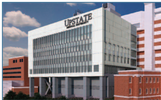
An artist's rendering of the new academic building which will house the College of Nursing.

Since July, concrete has been poured and steel beams erected for the new five-story academic building that will house Upstate's College of Nursing. The 80,000 square-foot structure on the west side of the Weiskotten Hall complex will be complete in spring 2016. The nursing college will be housed